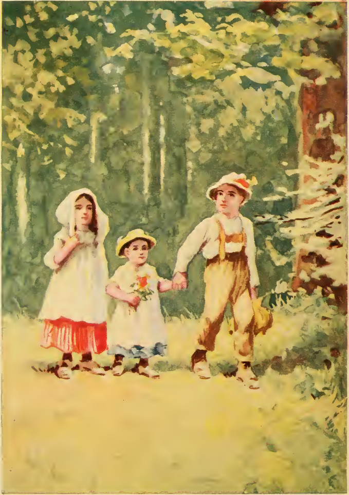
THE CHILDREN WENT INTO THE WOODS TO GATHER STRAWBERRIES